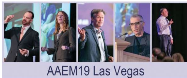
AAEM19 Las Vegas

Didn't get a chance to make it to AAEM19 or missed a couple lectures that you really wanted to see? AAEM Online is a FREE members-only benefit that allows you to stream video or audio from past AAEM scientific assemblies online, or download the MP3 or MP4 files.